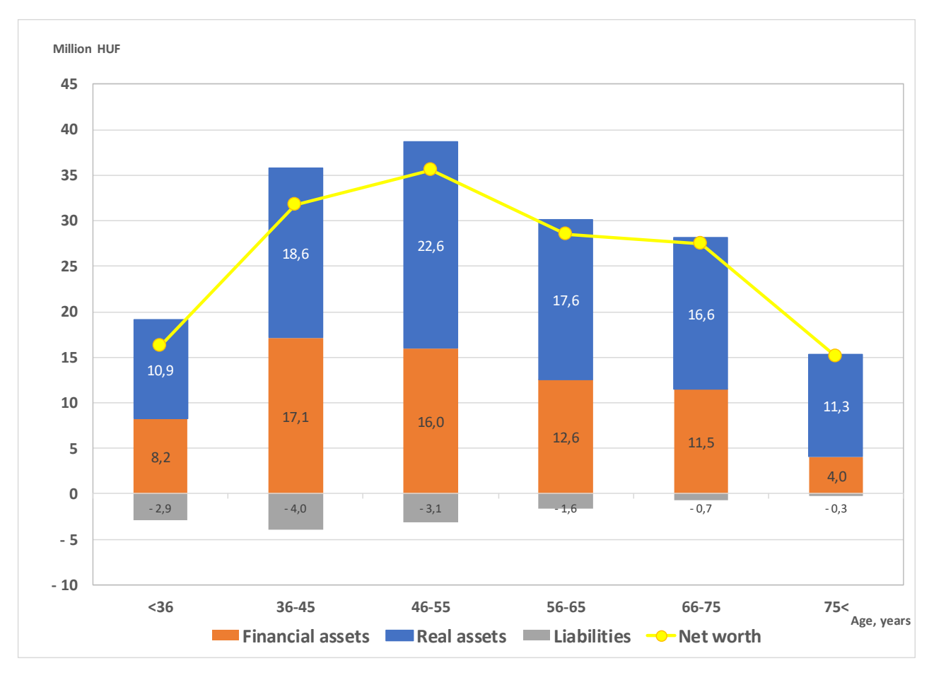
Chart 4 Average net worth per household and its composition by the age of the main wage earner<sup>7</sup>, at the end of 2017, HUF millions